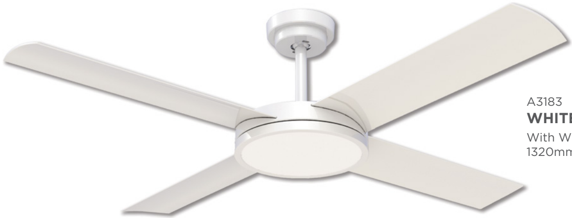
A3183 WHITE WITH LIGHT With White blades 1320mm (52")