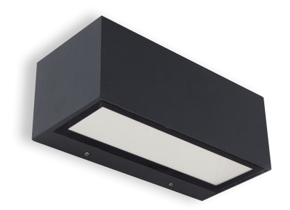
20W LED Bronte Up/Down CED8380